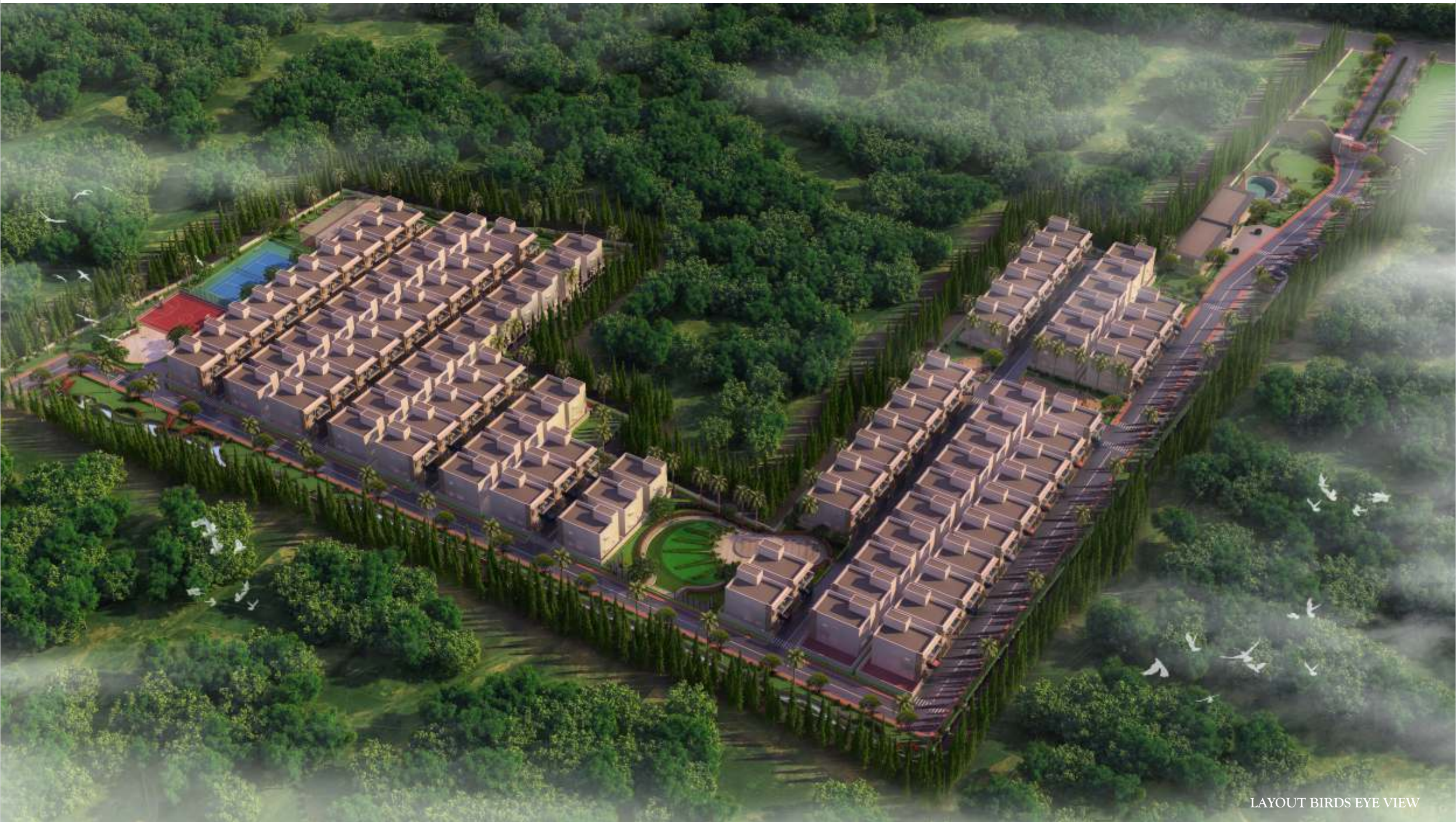
LAYOUT BIRDS EYE VIEW